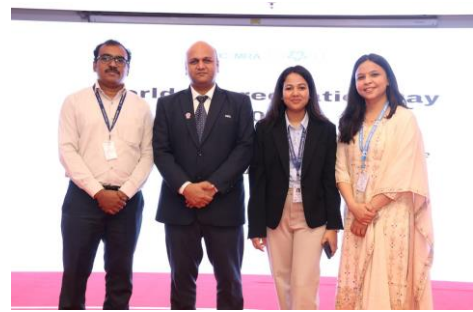
WAD Mumbai Event