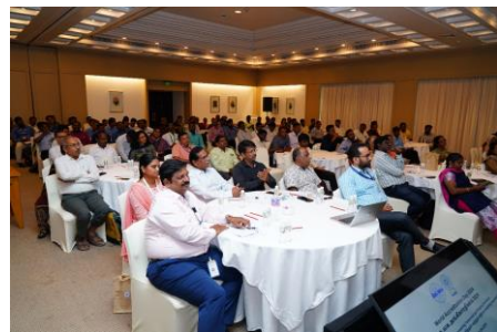
WAD Chennai Event