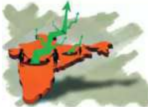
The report said geographically, the top 25 are mainly located in Europe, North America, and

"We are proud that India is rated among the top five accrediting systems in the world. We anticipate that India will pave the way for more collaborations aimed at creating resilient systems of high-quality infrastructure," the Quality Council of India (QCI) said in a tweet.